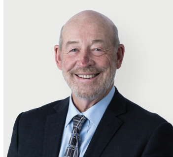
Terry Enright Chair