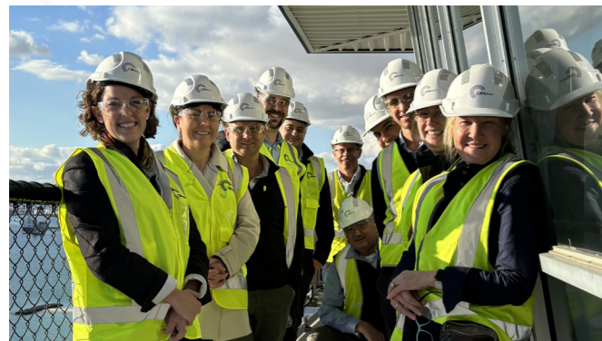
Wheat Council 2024 visit to CBH Group's Kwinana Grain Terminal