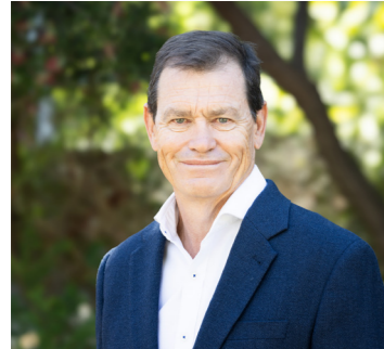
Andrew Young Chair