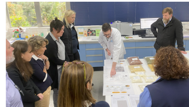
Pulse Council 2024 visit to AEGIC North Ryde