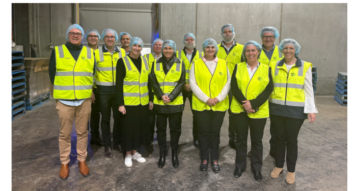
Oat Council 2024 visit to Unigrain