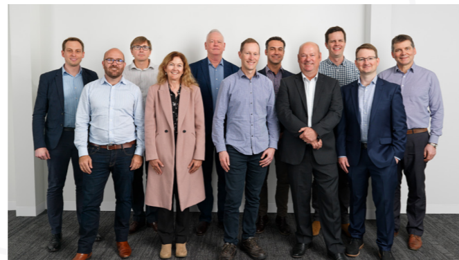
Barley Council members